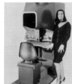
Fig. 1. Sensorama.

• Sensorama —The Sensorama Machine was concocted in 1957 and licensed in 1962 under patent # 3,050,870.Morton Heilig made a multi-tactile test system. A prerecorded film in shading and stereo,was increased by binaural sound, fragrance, wind and vibration encounters. This was the main way to deal with cre-ate a virtual reality framework and it had every one of the elements of such a situation, yet it was not intelligent.