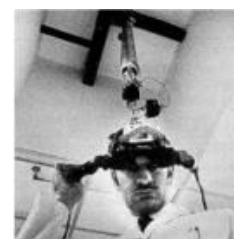
Fig. 2. Ultimate display.

• The Ultimate Display —In 1965 Ivan Sutherland proposed the ultimate solution of virtual reality: an artificial world construction concept that included interactive graphics, force-feedback, sound, smell and taste.