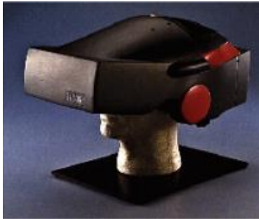
Fig. 3. Head mounted display.

•“ The Sword of Damocles ” –The first virtual reality system realized in hardware, not in concept. Ivan Sutherland constructs a device considered as the first Head Mounted Display (HMD), with appropriate head tracking. It supported a stereo view that was updated correctly according to the user’s head position and orientation.